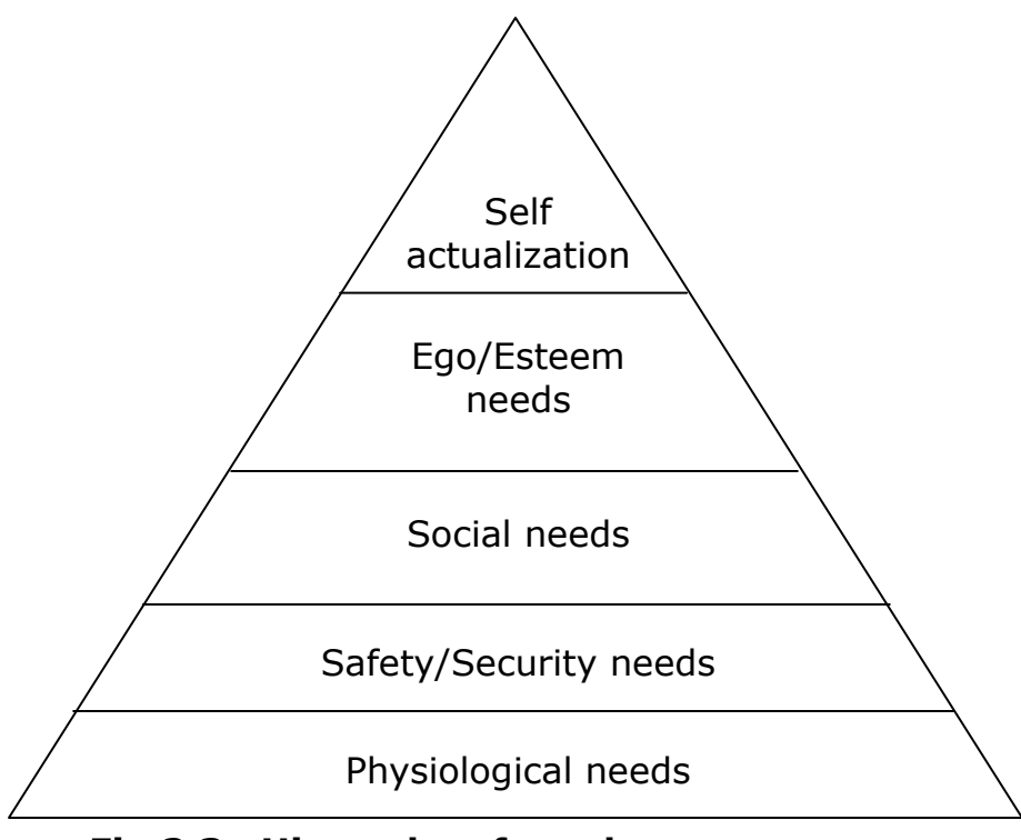
Fig 2.3 Hierarchy of needs