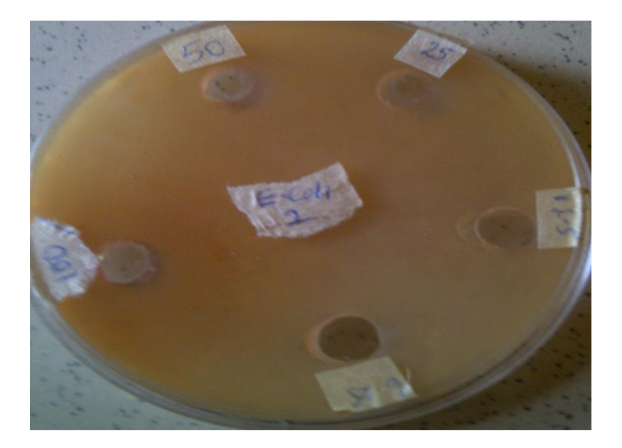
Fig 6: Agar plate showing the effect of H. sabdariffa on E. coli