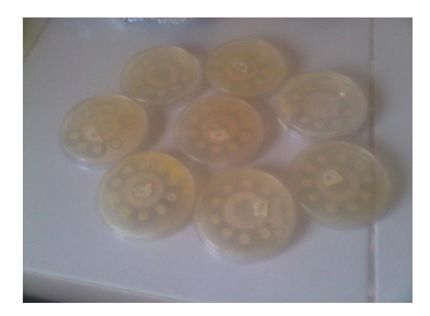
Fig 4: Agar plates showing the effect of antibiotics on other test organisms