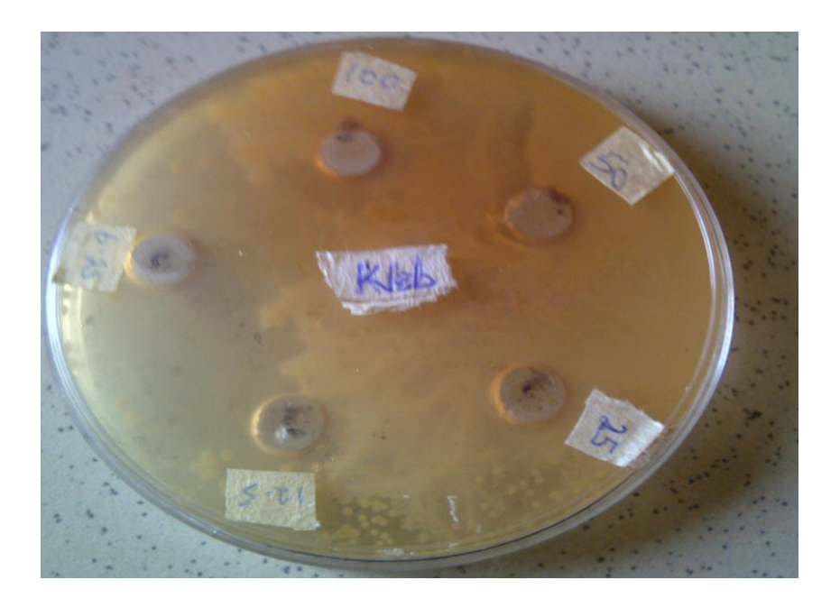
Fig 8: Agar plate Effect of H. sabdariffa on klebsiella sp