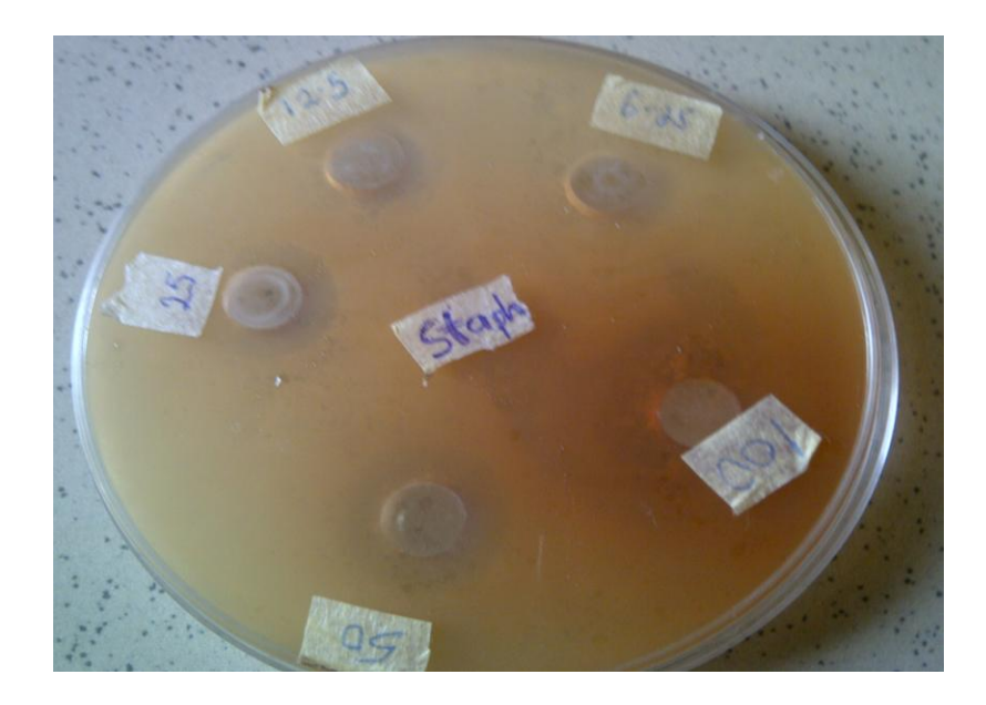
Fig 7: Agar plate showing the effect of H. sabdariffa on S. aureus