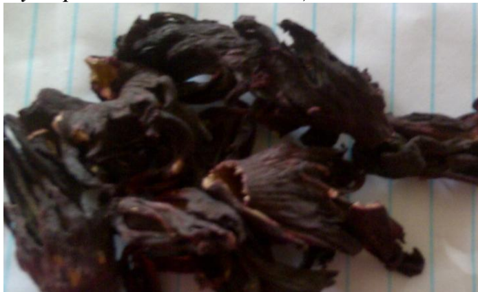
Fig. 1 Hibiscus sabdariffa calyces

more widely spaced, are shorter and many-branched, and their calyxes are picked when plump and fleshy. The fibre strands, 3 to 5 feet (1 to 1.5 metres) long, are composed of individual fibre cells. Roselle fibre is lustrous, with colour ranging from creamy to silvery white, and is moderately strong. It is used, often combined with jute, for bagging fabrics and twines. India, Java, and the Philippines are major producers ( Encyclopedia Britannica, 2012 ).