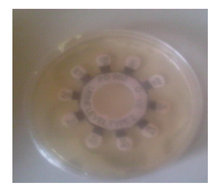
Fig 3: Agar plate showing the effect of antibiotics on S. typhi .