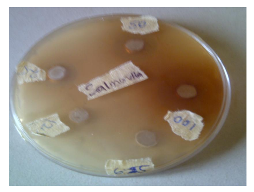
Fig 5: Agar plate showing effect of H. sabdariffa extract on S.